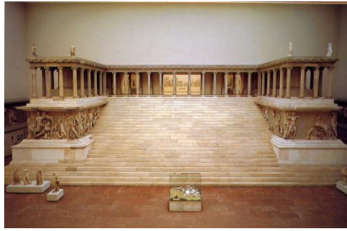
High Altar of Zeus, Pergamonmuseum, Berlin

To first century culture, there was but one locale that provoked such a pointed reference: The Great High Altar of Zeus. Constructed with a podium to emphasize and exalt Zeus, the forty foot open air marble altar was used for civic and dark ritualistic practices. Central to its opulent designs were the graphic sculptured friezes depicting the Gigantomachy : the struggles of the gods and giants, also familiar as The Battle of the Titans.