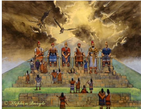
The pre-flood Nemrut Dagi Giants of Turkey

Quayle also examines encounters with giants who had been frequently recorded in the log books of the early explorers, from “Vespucci, Sir Frances Drake, De Soto, Coronado and Magellan. Out of place artifacts and practices are provocative as the suggestion of ancient giant civilizations participating in global commerce, ritualistic practices continue to surface.