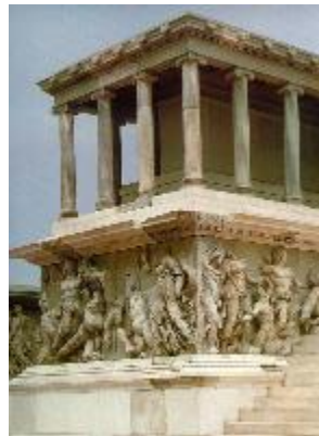
Detail, The Gigantomachy, Altar of Zeus

These graven depictions of horrific confrontations and bloodshed between humans and chimerical gods and goddesses provide an extensive chronicle of what were formerly believed to be imaginative projects and struggles. During the time of the Ottoman Empire, in the late 19 th century, the High Altar of Zeus was dismantled, shipped and reassembled in the Pergamonmuseum in Berlin, Germany.