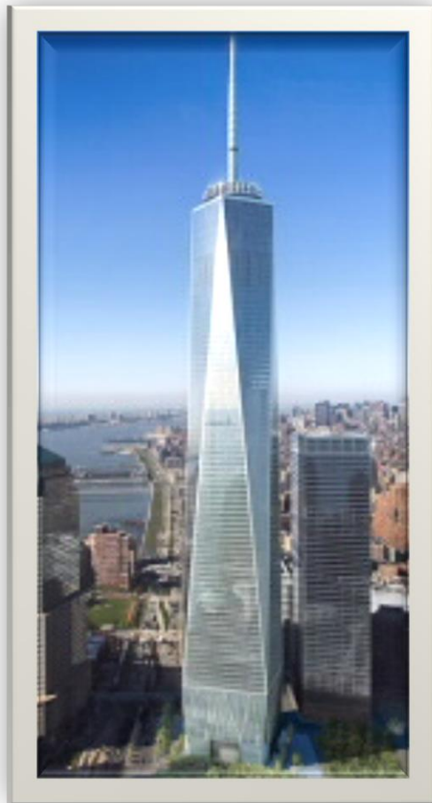
The Freedom Tower