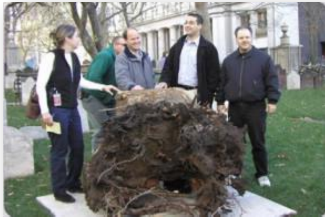
The uprooted sycamore at St. Paul's Chapel

The Bible records the sycamore tree as being a sign of judgment. It even says in Egypt the sycamore tree was struck down as a sign of judgment. On September 11 th , a freak event happened in the devastation: a steel beam from the North Tower was hurled from the sky. As the Tower fell, it went through the air and struck down an object: it was a tree.