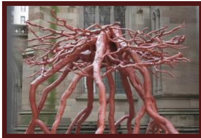
Bronze sculpture of the Sycamore, Steve Tobin

The buttonwood tree is more familiar as the American sycamore . This memorial on Wall Street would come to represent the riches of a nation uprooted, overturned, judged and displayed in bronze: and yet another idol.