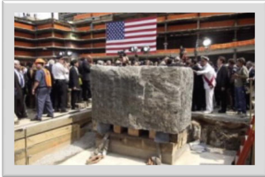
The Freedom Stone

the cornerstone for a new symbol of this city and this country and of our resolve in the face of terror. Today we build the Freedom Tower.”