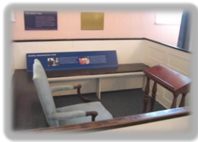
George Washington's Pew, St. Paul's Chapel

After the address, Washington, and all the other officials, the Senators, the House of Representatives, the Vice President, all left the place of Inauguration, travelled on foot to a small church, a chapel, they went inside...and we don't know exactly what they said there, we know they were there for one purpose. For two hours they prayed, they committed, they consecrated this nation into God's hands. The entire government was kneeling before God.