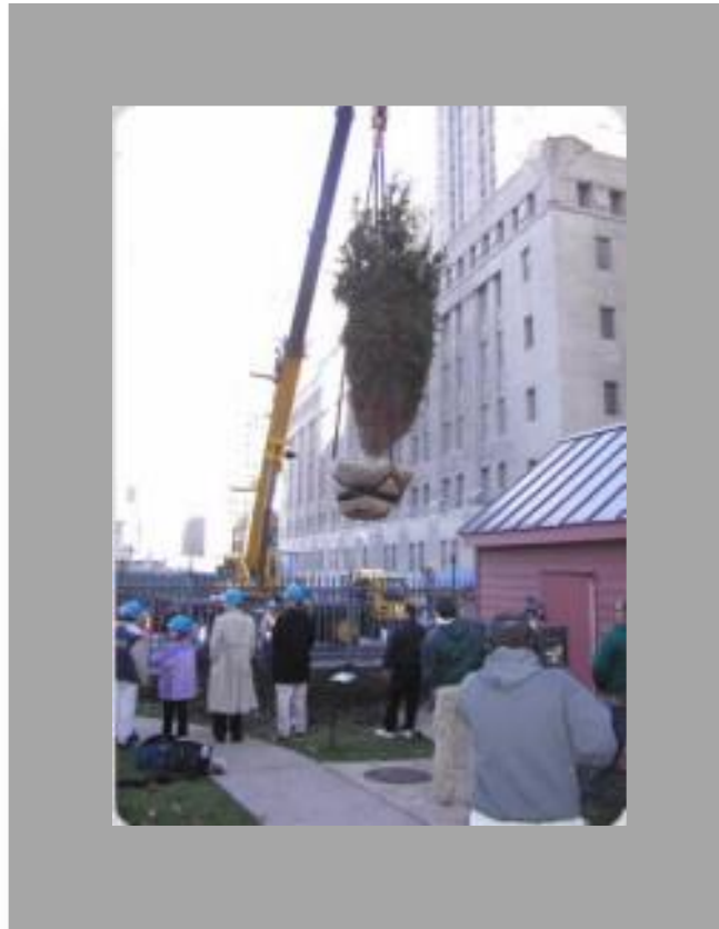
Cedar, St. Paul's Chapel, crane