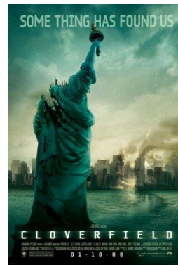
Cloverfield Theatrical Poster

Curiously, in early May, 2009, as a symbol of Mr. Obama's agenda for "a new beginning, restoring confidence in the American people, in their government, and in our place in the world," US Department of Interior Secretary Ken Salazar announced the reopening of the head of the Statue of Liberty. The Statue's head had been closed since September 11, 2001, but will open once again on July 4, 2009.