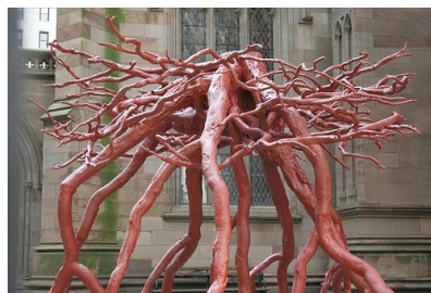
Bronze sculpture of the Sycamore, Steve Tobin “The Trinity Root”

The significance of the bronze sycamore root sculpture is chilling. In May, 1792, twenty-four stock brokers met underneath a buttonwood tree, along Wall Street in New York City. The Buttonwood Agreement would be birthed as the golden calf of commerce, the bull of the New York Stock Exchange, but would be delivered, uprooted and cast in bronze.