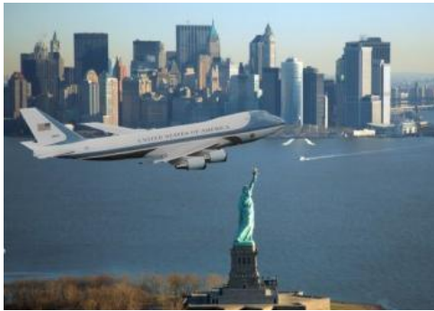
Air Force One, 4.27.2009